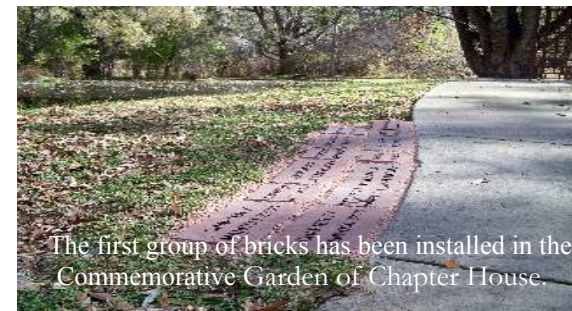
The first group of bricks has been installed in the Commemorative Garden of Chapter House.

Chapter House reserves the right to edit inscriptions submitted to assure consistency and readability. If necessary, donors will be consulted about the changes to be made and given the opportunity to suggest alternatives.